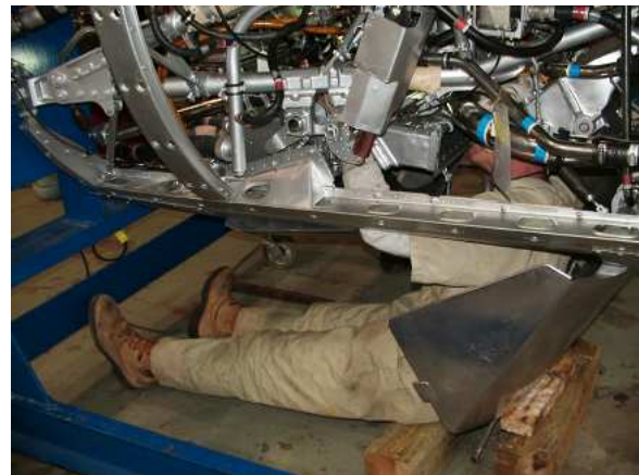
Figure 4.0.1: The last connections are the most difficult

Currently the QEC (Quick Engine Change) Assembly is in final stages of re-build requiring only the last sub-assembly, the two-stage intercooler, to be installed. However, some difficulties are being experienced in installing, securing and wire-locking pipes, conduits and ground straps due to limited space and access, as well as questions regarding their exact location and attachment. Improved photo-capturing and documentation will be required for initial disassembly of Nr2 Engine to avoid this problem in the future.