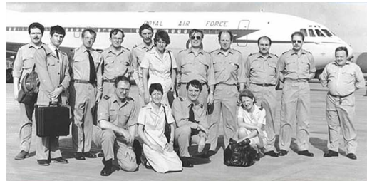
Figure 2.0.1: Lassa fever Aeromed team at Wideawake airfield, 1985

VC-10 out. It broke down, so I had a week in Washington. We flew down to Homestead Air Force Base, picked him up, brought him back.