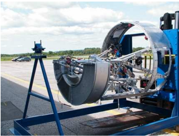
Figure 1.0.2: Power pack with connectors ready for remounting of the engine

The partially assembled engine was removed from the rotary frame and re-mounted onto the Power Pack minus the supercharger and intercooler. The many connections between the core engine and the Power Pack were made. These included cooling (3 systems: main engine, intercooler, and, lubricating oil to the 3-core radiator assembly at the front of the Power Pack), fuel and lubricant to the airframe through the bulkhead connectors, as well as fire-extinguishing facilities.